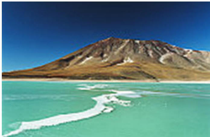
Table salt is not real salt. It is sodium chloride (NaCl) – manufactured for industrial use with sodium ferrocyanide and green ferric ammonium citrate added as anti-caking agents. Iodized salt contains potassium iodine. Sodium carbonate is added to preserve the color. What is the salt that humans have used for thousands of years?